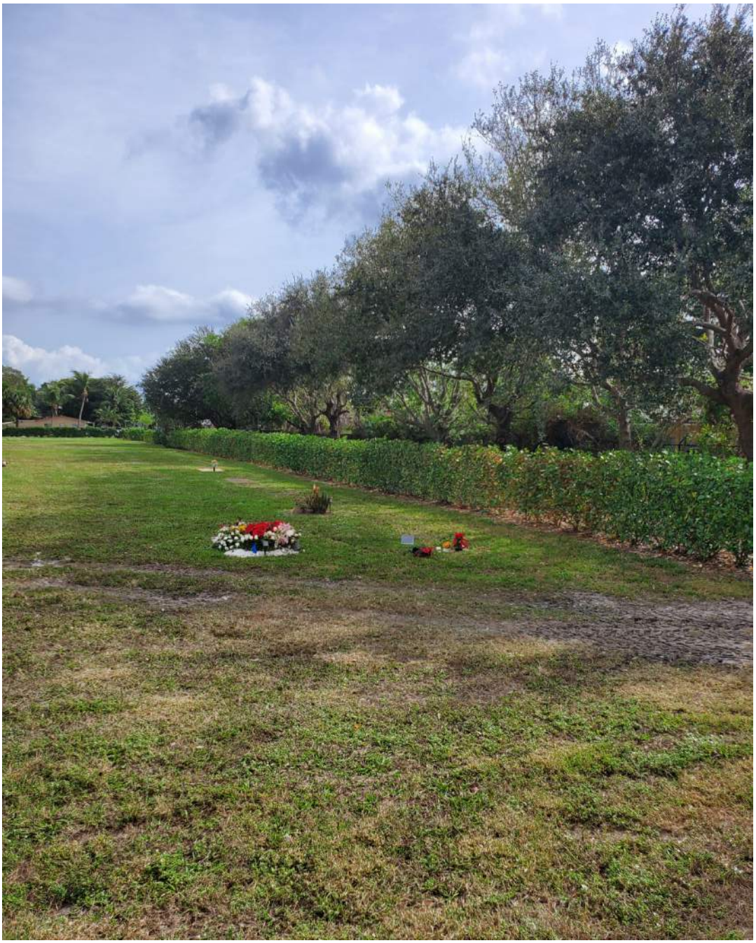
VIEW - C