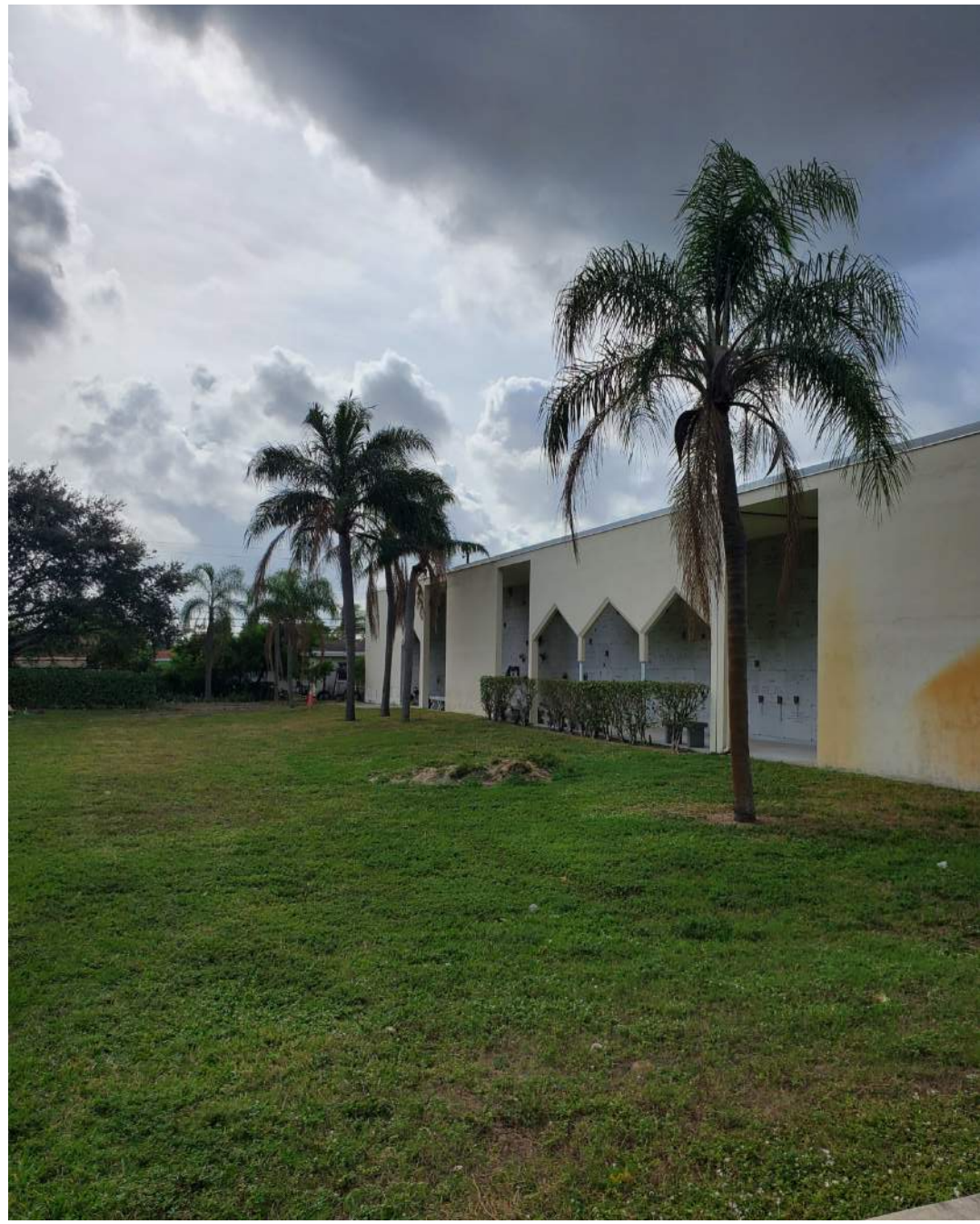
VIEW - B