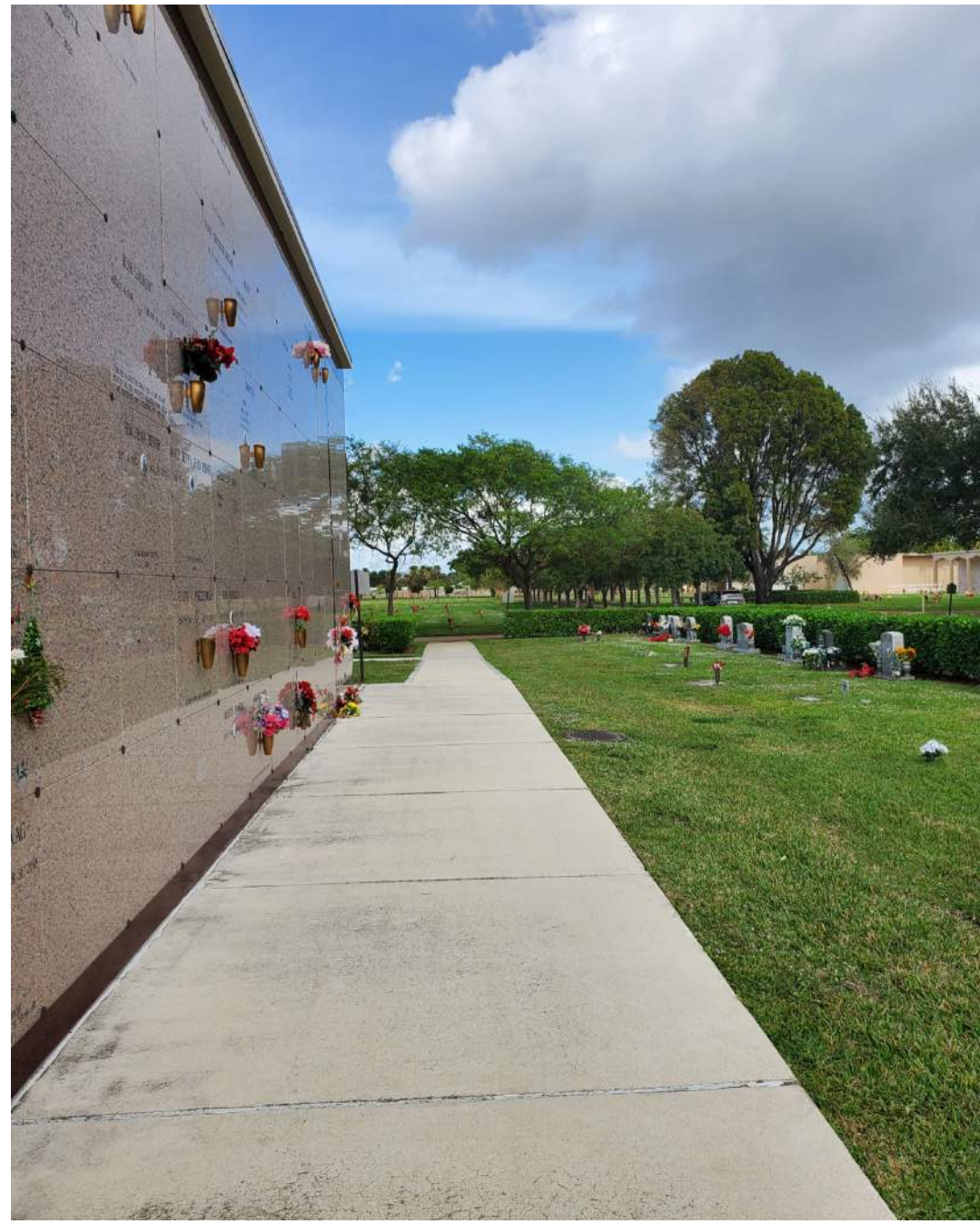
VIEW - A